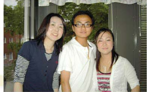
Photo taken with Japanese ladies