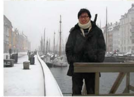
Copenhagen in winter

Being in Denmark for a year, I have developed a sense of belonging to it. I lived like Danes, shared its glory and missed it when I traveled to other places. Because of a sense of belonging, I stopped traveling in the second semester. Copenhagen is not a boring place. Endless excitements and happiness have brought us, a group of students from all over the world, together and became good friends. Now, most of us have gone back to our home cities/countries. We share the same hope, i.e. we will meet again one day.