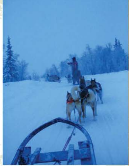
Sledging with husky

What's meant by broadening one's horizon? In my opinion, it is to experience something completely different and to start asking question on something that we've been taken for granted. I am thankful to have had this eye-opening opportunity.