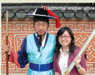
Traditional soldier attire