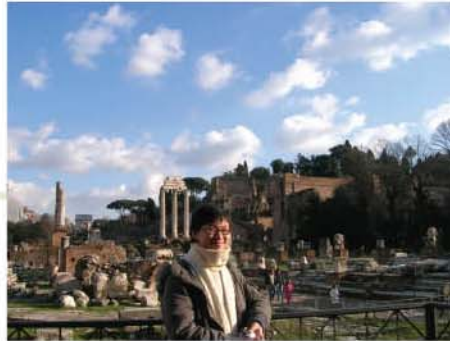
Rome in winter