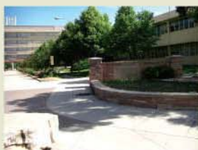
▲ Colorado State University