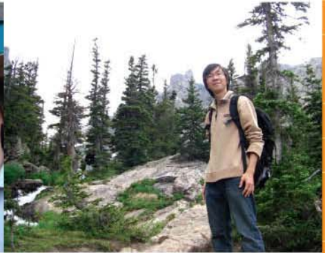
Hiking at Rocky Mountain