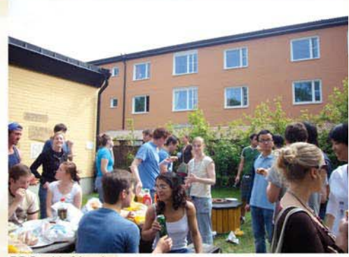
BBQ with friends

在這個交流計劃中，我體會到不少國家的文化，如西班牙人較熱情、日本人較拘謹但親切有禮、瑞典人較文靜等。希望大家作交流生前，多多思想除了學術以外可有的得著。