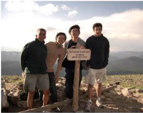
Elevation: 12000 Feet; 2.3m above sea level